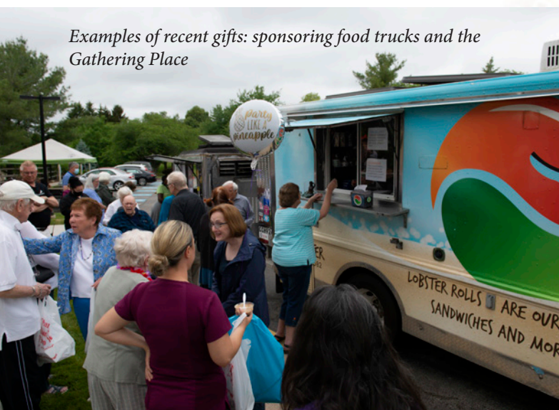
Examples of recent gifts: sponsoring food trucks and the Gathering Place

Area of Greatest Need – Some donations were unrestricted, allowing us to expand current programs, initiate new ones when needed, and assist in our progress to achieve our stated vision. All of these gifts contribute to our mission and the enrichment of our residents' lives.